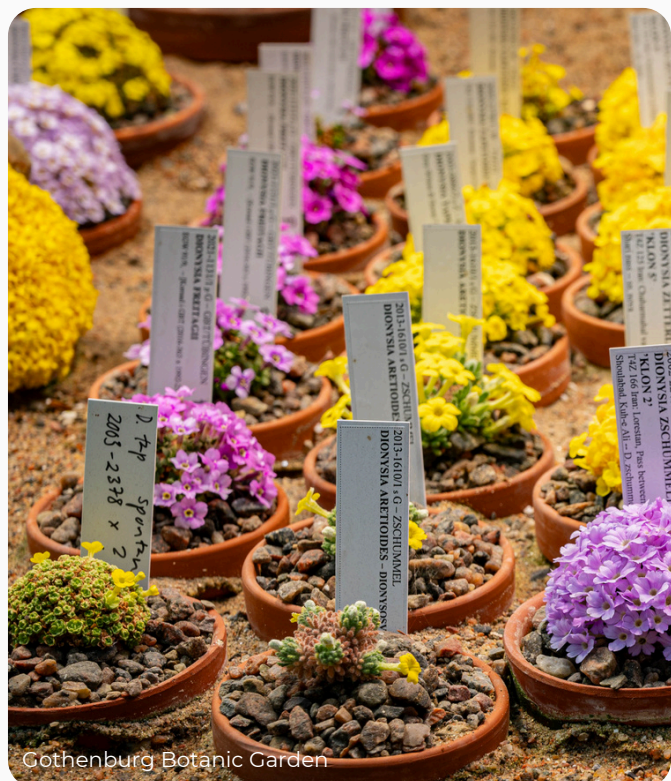
Gothenburg Botanic Garden

Europe's pivotal role in the naming and classification of global biodiversity over the past two centuries has led to a significant concentration of biological nomenclature resources within its borders. Many type specimens, vital for the accurate identification and classification of species, are housed in European museums, herbaria, and other institutions, along with some of the world's largest biodiversity libraries and scientific publishers. Under the Convention on Biological Diversity (CBD), Europe has a responsibility to address equitable access to and sharing of benefits from the utilisation of genetic resources, particularly with the countries of origin.