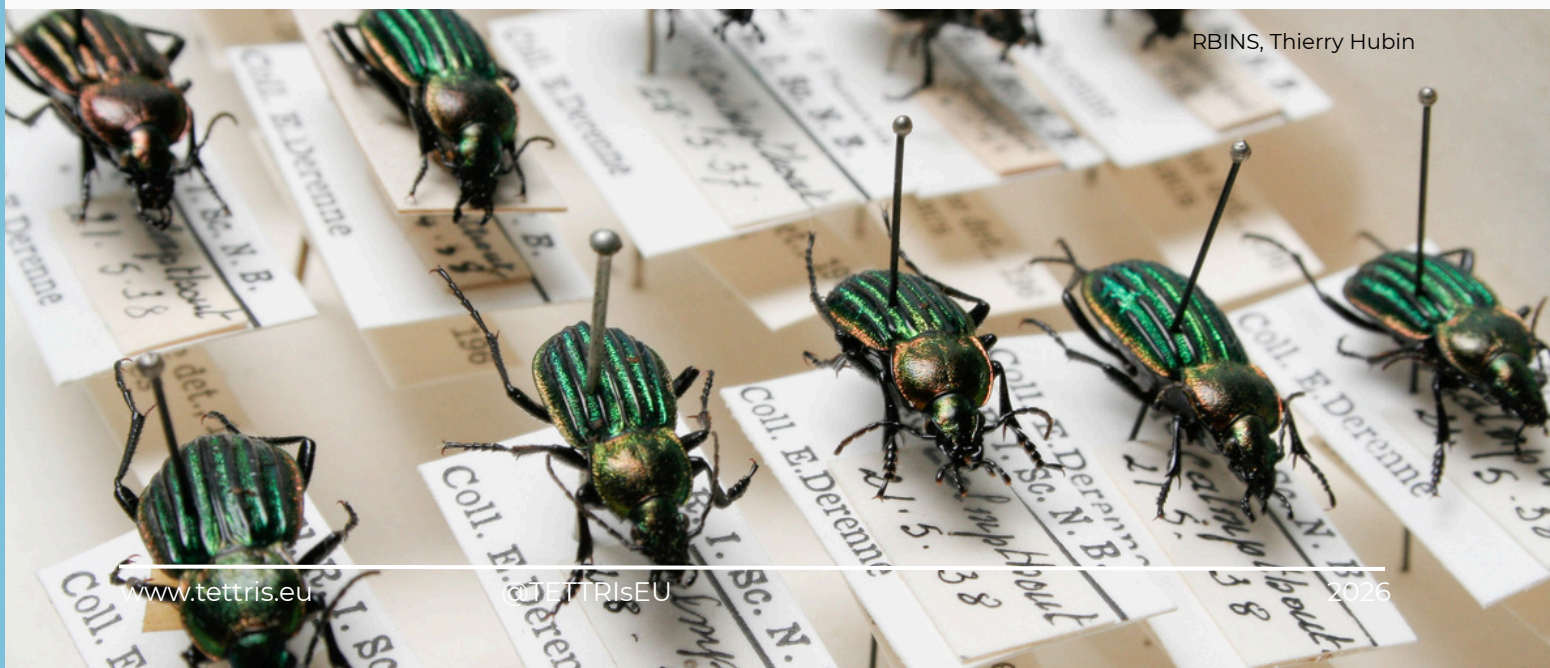
RBINS, Thierry Hubin

Implement mirroring of key nomenclatural databases within Europe, providing redundancy and seamless access to crucial biodiversity information and services.